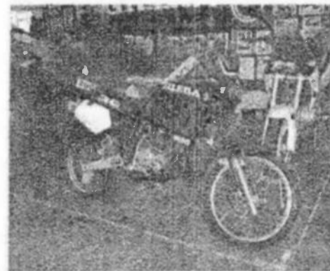
Gilera 125 RC and Gilera Saturno